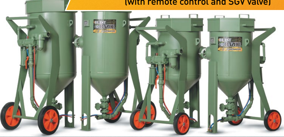
Special valve for steel abrasives SGV